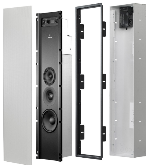
DSP730 shown with grille and RF500 rough-in box

The DSP730 can be combined with the Meridian DSW600 in-wall subwoofer to produce a full-range, two-box solution.